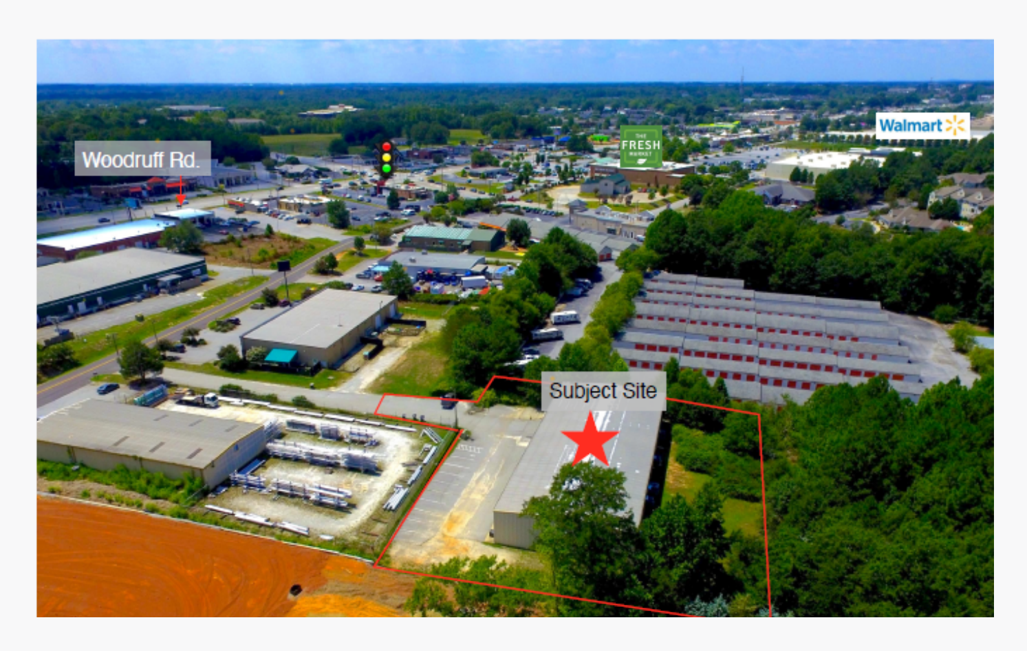
282 ROCKY CREEK RD., GREENVILLE, SC 29607