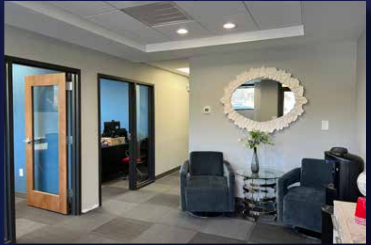
1328 SECOND FLOOR